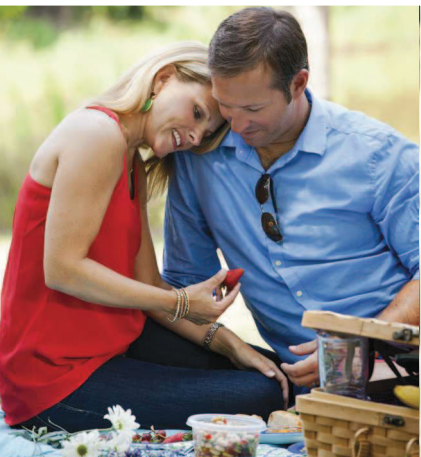
Even Mom and Dad get a quiet moment together.