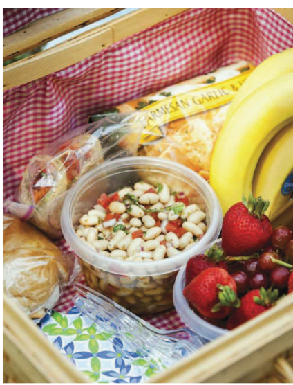
The family savors a picnic of ham sandwiches, veggie wraps, fruit and more.

drifted apart during college and lost track of each other.