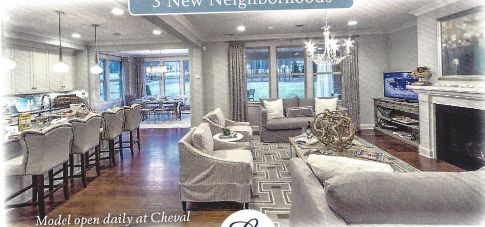
Model open daily at Cheval